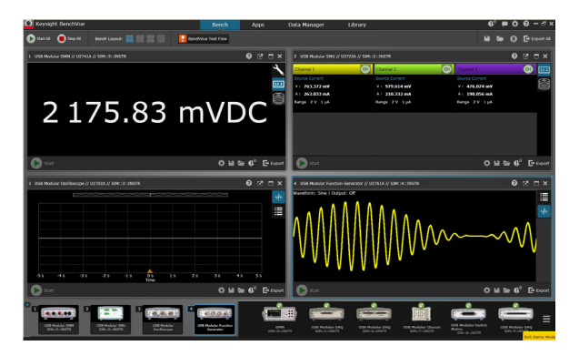
View measurements across USB DAQ, modular and bench instruments all on one BenchVue interface.

The USB Modular SMU App within BenchVue allows you to quickly control the U2722A/U2723A SMU to visualize measurements, perform data logging and annotate captured data. With BenchVue, you can visualize multiple SMU channels simultaneously, in addition to performing the following: