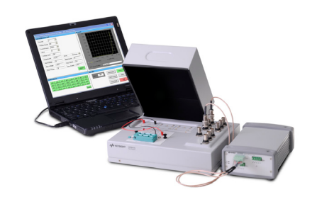
Download specifications for the U2941A Parametric Test Fixture from www.keysight.com/find/U2941A.

A purchasable upgraded software, the Keysight Parametric Measurment Manager Pro (U2942A), analyzes discrete semiconductor and plots the results in an IV curve. See page 9 for more information on the PMM Pro software.